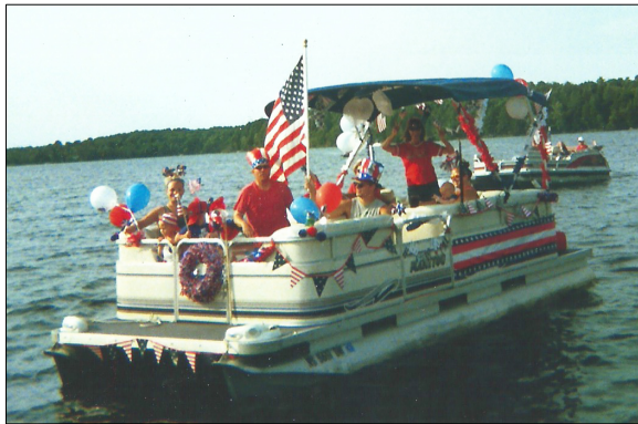
Winner of the award for "Most Patriotic Float" July 3 rd , 2018.