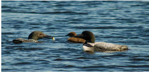
Loon pair with chick, Sanderson Bay, summer 2018.

has returned for at least ten years to raise her family in this location. One year, two of the pairs' eggs met with tragedy. The third attempt was the charm and they hatched a chick the first part of July. The little one had to grow up quickly to migrate before the lake froze. Mission evidently accomplished.