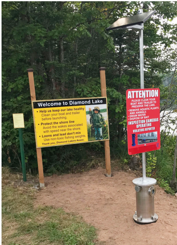
AIS Camera Installation with solar panel and new DL Sign at the boat launch, August 2018.