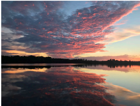
The long days of summer, solstice sunset 2018. - RWJ.